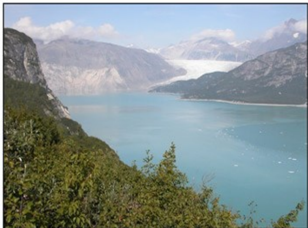
Changes are coming quickly. The picture on the left is of Muir Glacier in Alaska, taken on August 13, 1941. The picture on the right was taken on August 31, 2004. In just 63 years, the glacier has retreated more than 12 kilometers and is backfilled by ocean water.