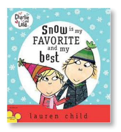
Snow Is My Favourite and My Best by Lauren Child