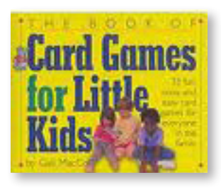
The Book of Card Games for Little Kids by Gail MacColl