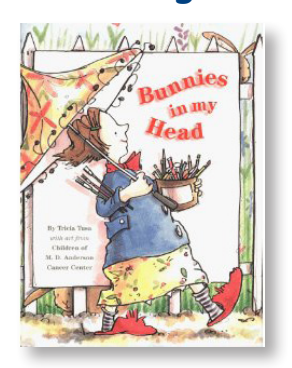
Bunnies in my Head by Tricia Tusa

You will need some blank paper, drawing materials, lined paper, and a pencil or marker.