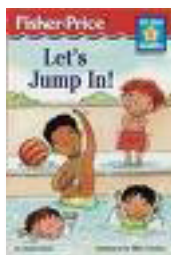
Let's Jump In! by Susan Hood

You will need swimsuits and a bathtub, a shallow pool or a beach with an area of shallow water.